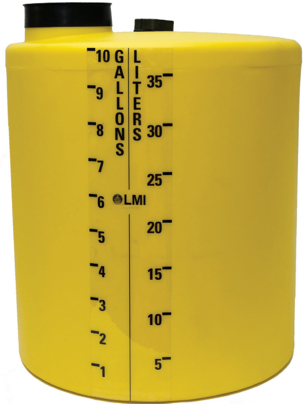
Model No. 27421 Tank Assembly (Pump must be ordered separately.)